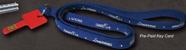
Pre-Paid Key Card

*Available Only at the Milford Hills Hunt Club in Johnson Creek, WI